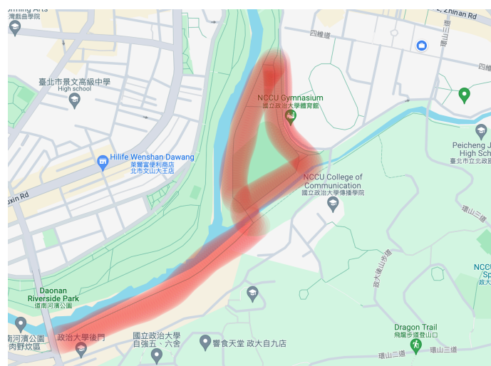
Updated location for NCCU Cleanup

The cleanup was initially conceived as a riverway cleanup as the Zhinan Creek running adjacent the NCCU main campus in Muzha was found to be exceptionally littered with trash, detritus and other human garbage. It was our intention when we wrote our proposal to concentrate our efforts on cleaning this waterway. However, over the summer holidays, major earthworks began on the reshaping and reworking Zhinan creek began so we were required by necessity to pivot in our location to focus instead on the riparian zones and sports-fields adjacent to the NCCU campus.