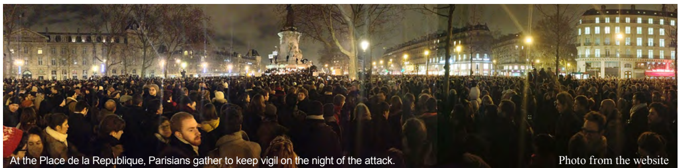
At the Place de la Republique, Parisians gather to keep vigil on the night of the attack.

After the assault, several peaceful demonstrations took place in many cities in France, including Toulouse, Nice, Lyon, Marseilles, and Rennes. January 8 was declared a national day of mourning by the French president. In the face of violence and grief, the French showed remarkable solidarity and activeness, proving that it is still a responsible and compassionate place where international students can find support during their pursuit of an international experience.