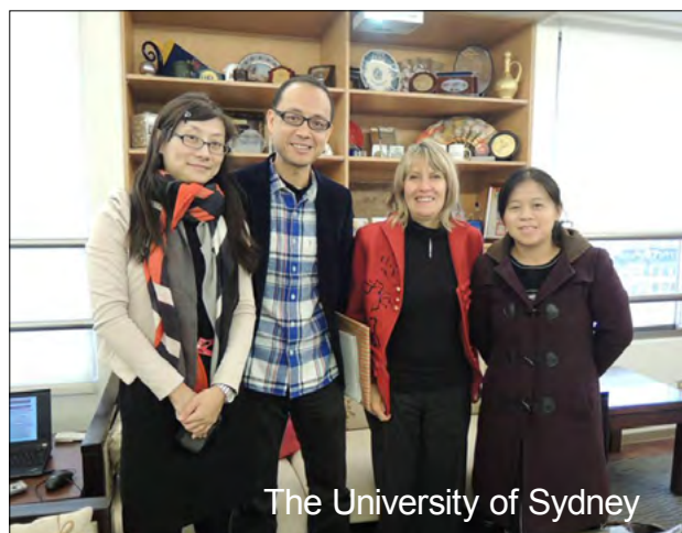
The University of Sydney