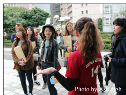
Exchange students join the campus tour organized by SA, getting ready to start their new life on this new campus.

Beside the presentations, outdoor activities were also offered during the orientation, such as information stands outside the building and campus tour. Students were given the chance to ask questions about the enrollment procedures, visa, insurances, as well as various events held by the clubs. During the campus tour, students were introduced to the surroundings, facilities and the featured sites on campus. The orientation event ended with big smiles on the students’ faces, a sign that they are ready to start their new lives at NCCU.