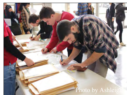
Exchange students register for 2015 Spring Orientation.