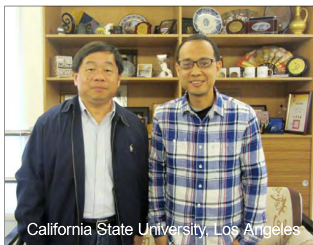
California State University, Los Angeles